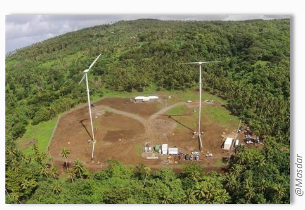
First wind farm in the Independent State of Samoa